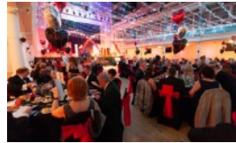
GMAS VALENTINES BALL