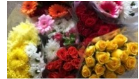
FLOWER ARRANGING ACTIVITY